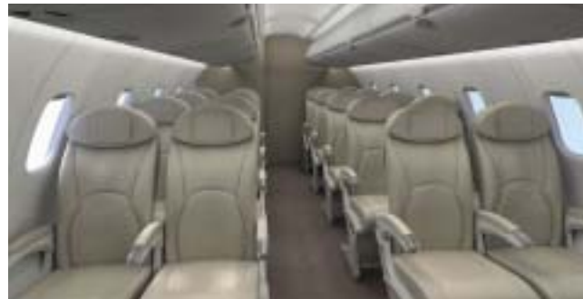
Interior view of The Challenger 850 shuttle.

With a range of 1,669nm, the standard Challenger 890 can accommodate 90 passengers. The split-cabin edition holds 52 (12 executive) and the deluxe version has 52 in business-class seating, with a range of 1,971nm.