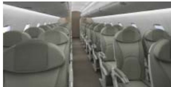
Interior view of The Challenger 870 shuttle.