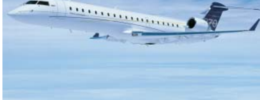
The Challenger 870

For several years Bombardier has been offering the Challenger 800—a shuttle also based on the CRJ200—on an ad hoc basis. But has now decided the time is right to offer a more cohesive shuttle solution because companies are increasingly finding it harder to transport employees efficiently on the airlines. Interestingly the whole CRJ fleet are derivatives of the Challenger 601 business jet. The three CRJ models and the Challenger 601/604 are also powered by the same engine—the General Electric CF34. This now brings the airframe back to its roots.