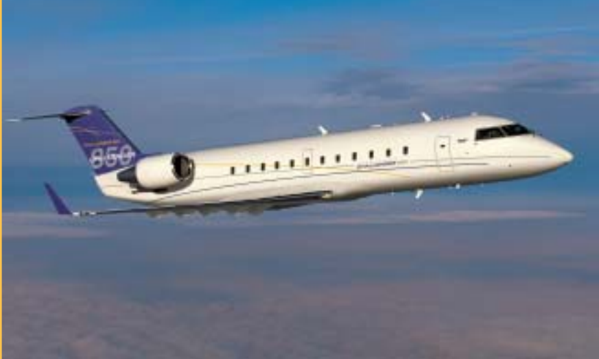
The Challenger 850