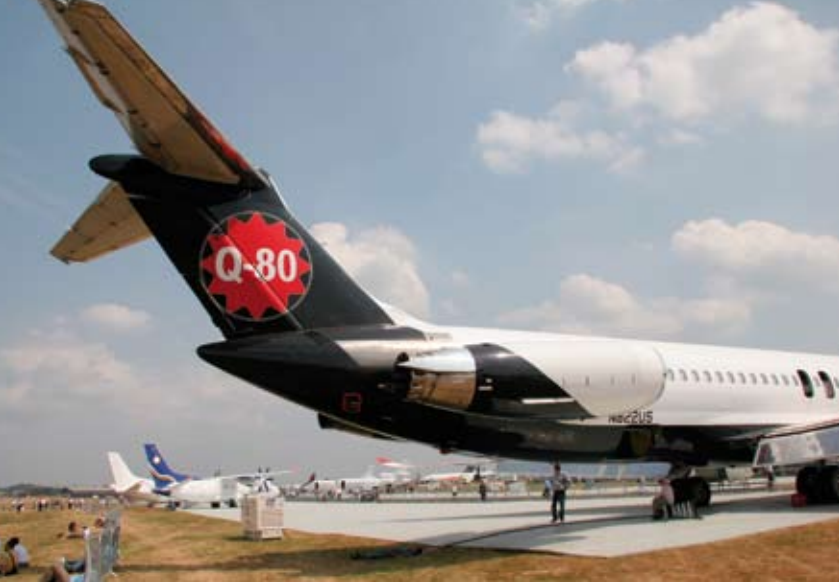
Comtran's Chapter 4 hushkit for the MD-80 received EASA approval in 2007

A second stretched variant, the 787-10, has been proposed. This would be a double-stretch of the -9 and seat around 310 passengers in a three-class layout – making it similar in size the 777-200 variants. Studies have effectively been put on ice as