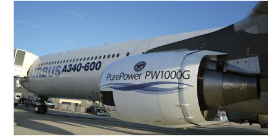
Airbus is flight-testing the GTF before deciding whether to adopt it for a narrowbody application

Final assembly is undertaken in Toulouse and Hamburg Finkenwerder in Europe, at Tianjin Binhai in China Final assembly of the first A320 at Tianjin began in August 2008. The Tianjin plant comprises an all-