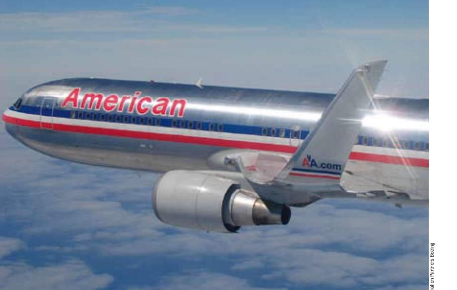
American Airlines is launch customer for the Aviation Partners Boeing 767 winglet upgrade

Three basic passenger variants of 767 have been developed, as well as one freighter model. United Airlines put the original 767-200 in to service August 1982. The longer-range -200ER followed with Ethiopian Airlines in May 1984, and the 6.4m-longer, 269-seat (two-class) -300 was certificated in September 1986. American Airlines was the first to operate the extended-range -300ER, in February